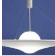
white fabric and light grey finishings